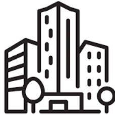
SME & Enterprise