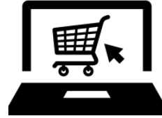
Retail and Ecommerce