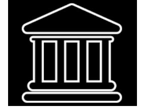
Govt & PSU